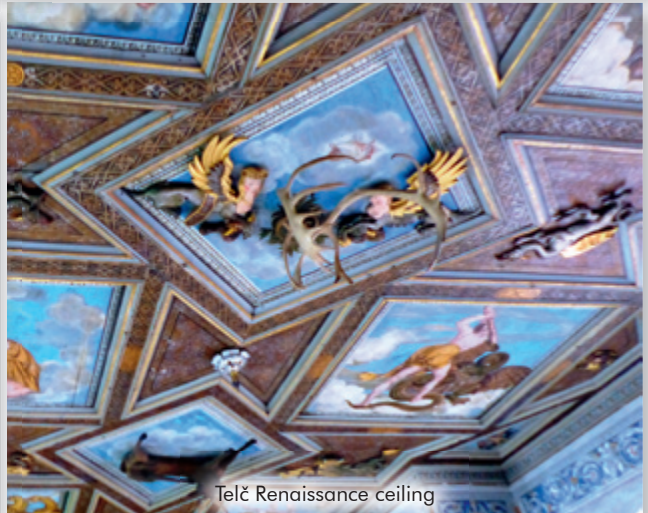
Telč Renaissance ceiling