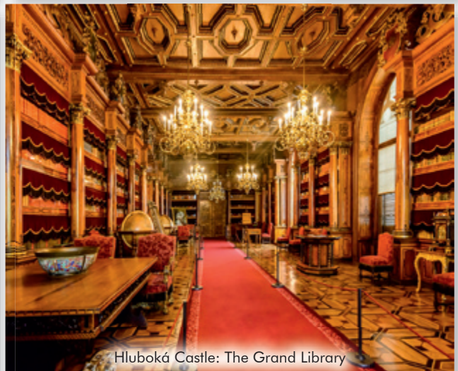
Hluboká Castle: The Grand Library